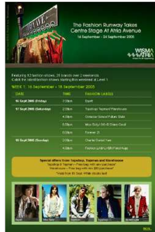
Electronic Direct Mailer