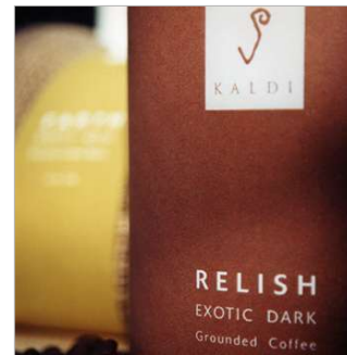
Branding & Packaging Design